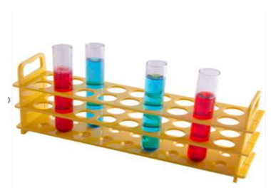
Test Tube Rack