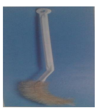
Beaker, bottle, flask brush