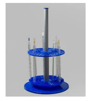
Circular Pipet Stand