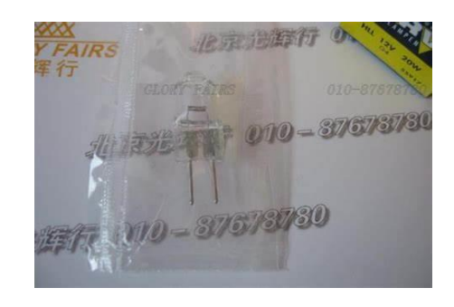
Halogen Lamp, NA55917 12V