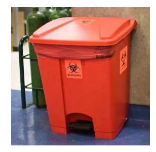
Red sharps biohazard